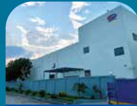
R - PAC