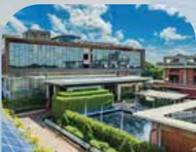
Columbia washing plant ltd