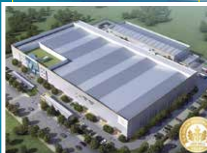
LEED Factory HVAC & Ventilation