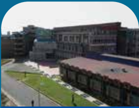
Square Textiles Ltd