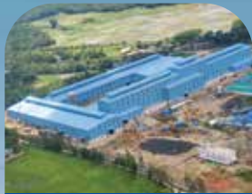
PHP Steel Plant